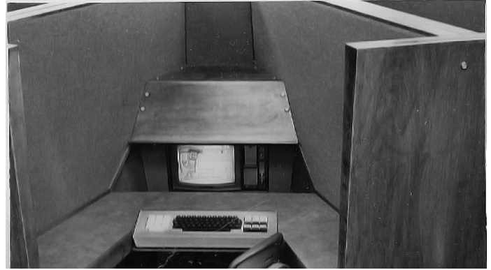
Figure 2: TICCIT Individual Carrel (Above) and Open Group of Table-Mounted Terminals (Left)

More TICCIT lessons were completed in Cycle 2 than in Cycle 1.