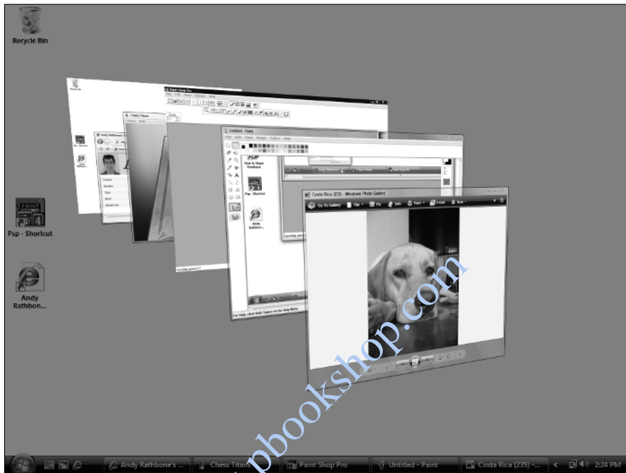
Figure 1-4: To see a 3D view of your currently open windows, press Tab while holding down the Windows key. Press Tab or spin your mouse's scroll wheel to flip through the windows and then let go of the Windows key when your window is on top.

Hover your mouse pointer over any name listed on your desktop's taskbar, and Vista displays a thumbnail picture of that window's current contents, making your window much easier to retrieve from the sea of programs.