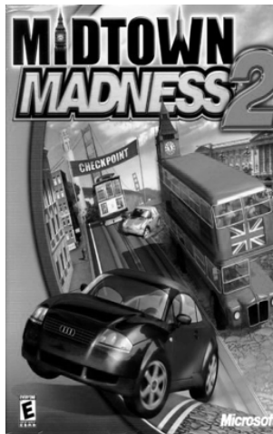
Figure 2.1 Cover of Midtown Madness® 2

Box shot reprinted with permission from Microsoft Corporation.