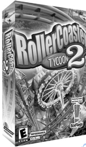
Figure 2.2 Cover of RollerCoaster Tycoon 2®