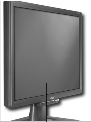
An LCD monitor with a flat screen