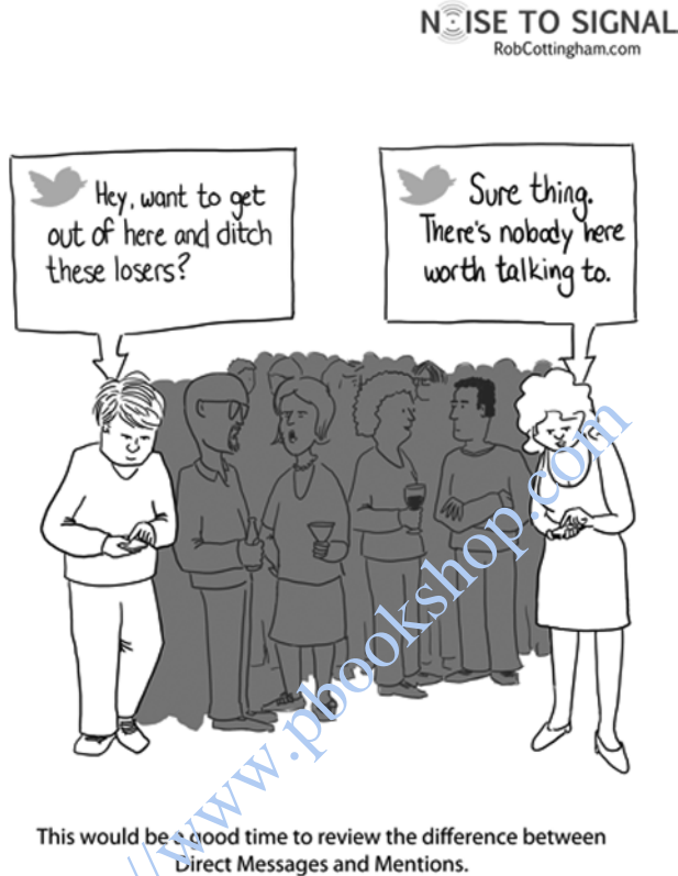
FIGURE 1.2 Public vs. Private Social Networking

conduct yourself—both online and offline—in a way that shows the utmost respect for everybody. You never want to come across as competitive, pushy, careless, or clueless; instead, you want to convey that you’re someone who’s genuine and caring. You want to create a brand that people adore—one with which they want to interact and that they’d love to promote.