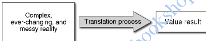
FIGURE 1.1 The Foundation of Valuation Assessments Is a Translation Exercise

How should value be determined? There are an almost infinite variety of possibilities; some are logical and reasonable, some not. No matter what method is used to measure value, however, the foundation of each valuation assessment is a translation exercise (see Figure 1.1). The valuation process takes a complex, ever-changing, and messy reality and translates it into a simplified, numerical measurement (see Box 1.2) or value result. In the case