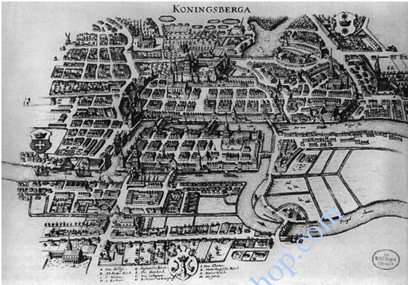
Figure 1.1 Problem of the Seven Bridges of Königsberg

changing the graph itself. The existence or absence of a link between a pair of nodes represents everything in terms of social network analysis. Even when calculating individual network metrics for the nodes, the links are taken into consideration to perform it. For instance, the degree of a particular node is the number of related nodes it has. The related nodes are established by the link between a pair of nodes, the original one and the related one. Then the node's measure degree is computed by counting the number of links it has. Social network analysis is the study of the relationship among the nodes, and the relationship is defined in this context by the links.