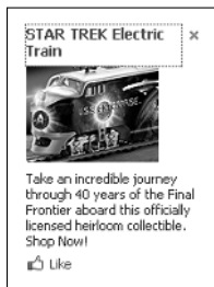
Figure 1-6: You can directly market your products on Facebook...

It's no wonder that direct marketers are flocking to Facebook. When measuring results, a one percent difference in outcome could easily translate into hundreds or thousands of additional sales, depending upon the scale. That's why Facebook is a direct marketer's dream. The site allows you to run very focused and incremental tests, optimizing what works, and expanding your scope to reach up to tens of millions of consumers. For example, the Bradford Exchange uses Facebook Ads to market their Star Trek Electric Train (see Figure 1-6), where interested parties click the ad to buy the train from their Web site. (See Figure 1-7.)