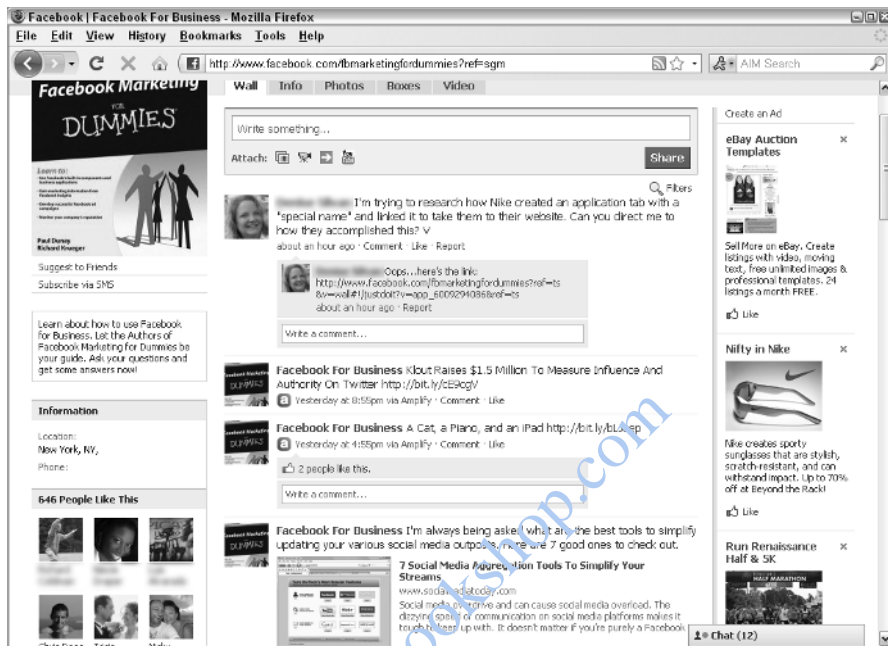
Figure 1-1: Facebook Ads appear along the right side of the page.

Facebook also adds a link entitled Like to do one of two things. If the advertiser is promoting a Facebook business Page, then clicking Like will add that user to the Facebook Page as a Fan. Otherwise, this link let users vote whether they like the advertisement. This is one way how Facebook enables its community to help police the types of ads that get displayed on the site. It also adds an interactive nature to the ads because when someone clicks the Like link for an ad, their friends find out that the person liked the ad, which may prompt some friends to view the ad as well.