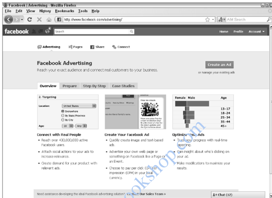
Figure 1-3: Start at the Facebook Advertising home page.