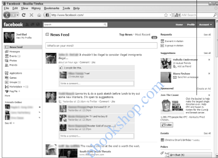
Figure 1-2: A social ad offers visitors the ability to engage in a social action.

A Sponsored social ad inviting visitors to “click the bucket”