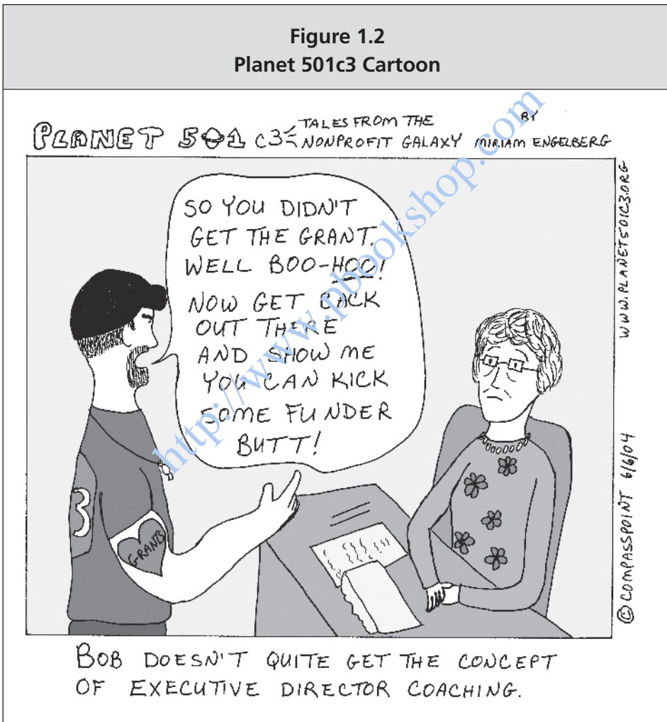
Figure 1.2 Planet 501c3 Cartoon

Coaching is not punitive or just for performance problems. Coaching is not meant to deal with the ongoing performance problems of a staff person. Coaching is an investment in the development of an individual. Many