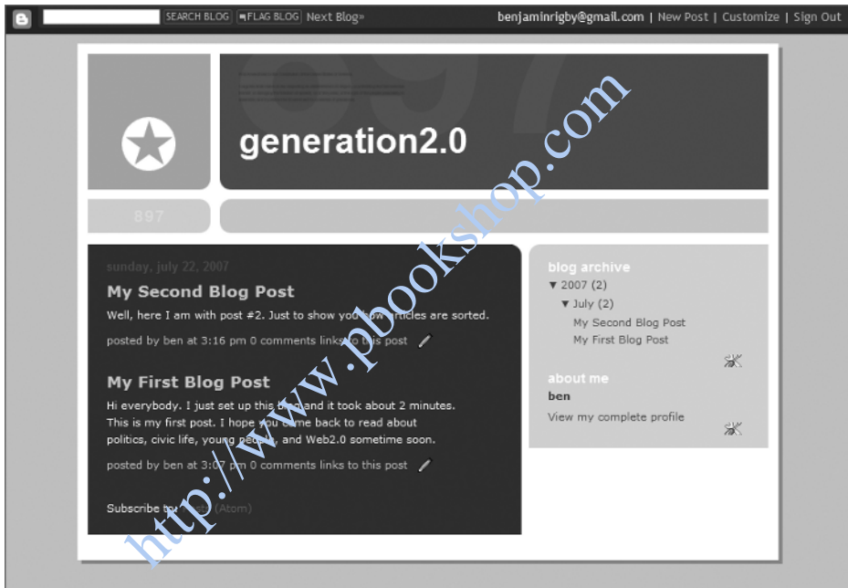
Figure 1.2. Two Posts on My New Blog

The most recent post is listed at the top. Note the comments link beneath each post. Most blogging software allows the blog owner to choose whether he or she wants to allow public comments, allow approved comments, or not allow any comments. During the two-minute setup process, I chose this design template from among many possibilities. Most blogging software offers a range of predesigned templates from which to choose. If you have a bit more technical knowledge, you can customize the blog design to match your organization’s brand identity.