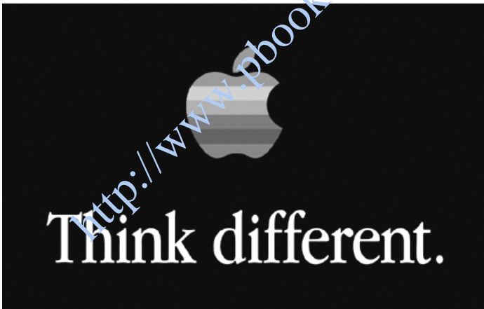
Exhibit 1.1 Apple Advertisement

It needs us all to not just think outside the box (indeed, recently a friend of mine remarked that these days there are so many people thinking outside the box that it has become cool to think inside it), but to fundamentally shift our thinking. And as so often has happened in the past few years, those Californian design and psychology geniuses at Apple were ahead of the game on this one. “Think different” was a downright revolutionary slogan back in the 1980s when Apple first used it in its advertising. (See Exhibit 1.1.)