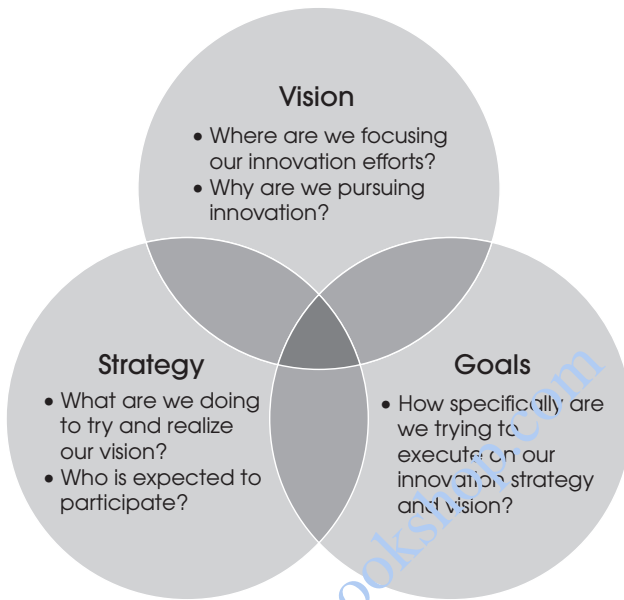
Figure 1.1 Venn Diagram