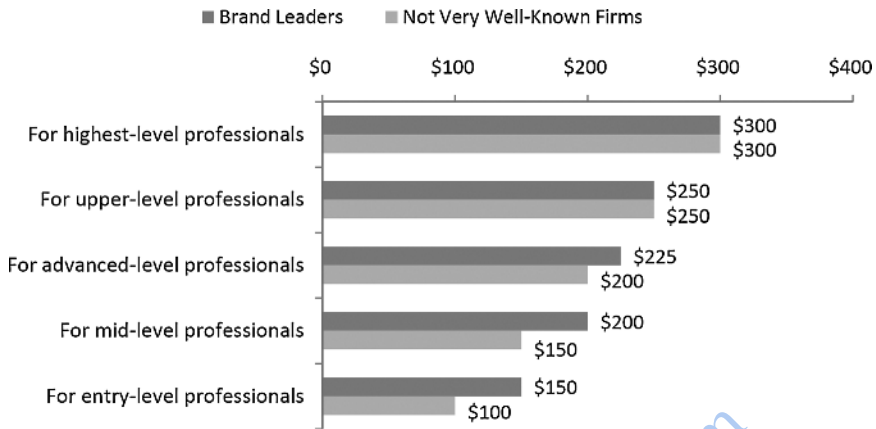
Figure 1.3 Median Hourly Billable Rates for Consulting Industry—Standard/Published, by Brand Reputation

When we ask leaders of strategy consulting firms what companies they consider to be their competition, we hear comments like, “We compete with firms like McKinsey, Bain, Boston Consulting Group, and other major firms, and we charge fees similar to theirs.” Of course, the firms mentioned are extremely well-known and respected.