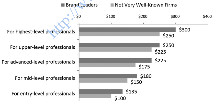
Figure 1.4 Median Hourly Billable Rates for Consulting Industry—Actual/Realized, by Brand Reputation

When we ask leaders of strategy consulting firms what companies they consider to be their competition, we hear comments like, “We compete with firms like McKinsey, Bain, Boston Consulting Group, and other major firms, and we charge fees similar to theirs.” Of course, the firms mentioned are extremely well-known and respected.