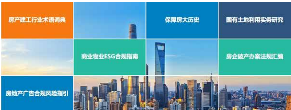
(房地产主题精华内容)

贴合行业关注，就业务流程中的重点问题予以深入剖解，助力企业分节点、分流程进行合规与风控管理。