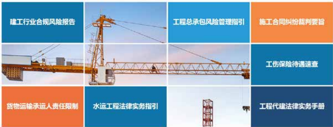
(Highlights of Construction Project Themes)