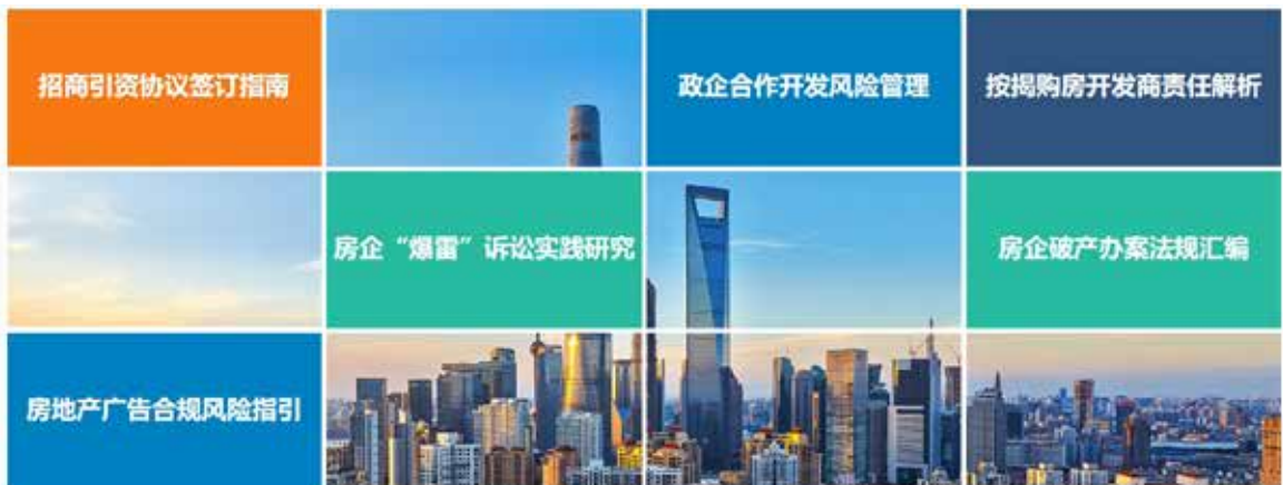
(Highlights of Real Estate Themes)