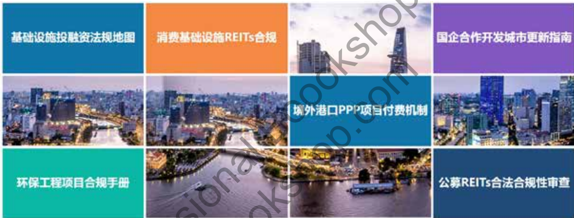
(Highlights of Infrastructure and Urban Renewal Themes)