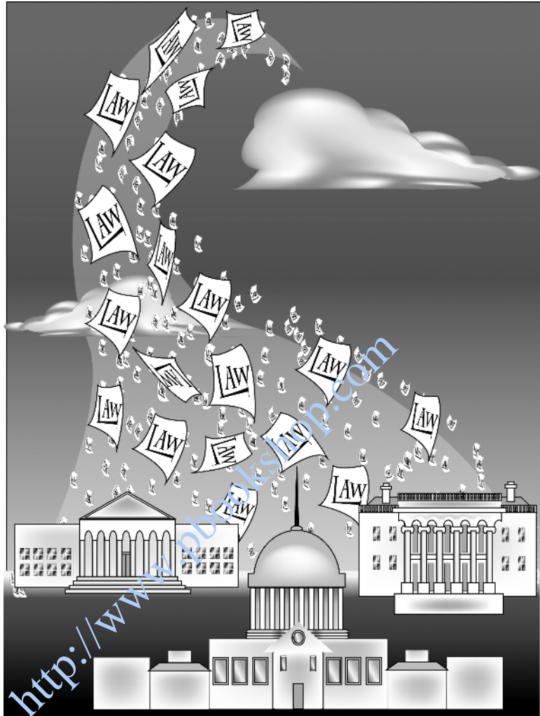
Figure 1.1 The legislative, executive and judicial branches of government make law. Illustration: Kalan Lyra

law, the judicial branch interprets law, and the executive branch enforces law. Although this is true, it is also a little misleading because it suggests that each branch is completely compartmentalized. Actually, all three branches make law. The legislative branch produces statutory law. The executive branch issues executive orders and administrative rules. The judicial branch creates law through precedential decisions. In the United States, sources of law include constitutions, statutes, executive orders, administrative agencies, federal departments, and the common law and law of equity developed by the judiciary. The most important source of law, however, is the U.S. Constitution.