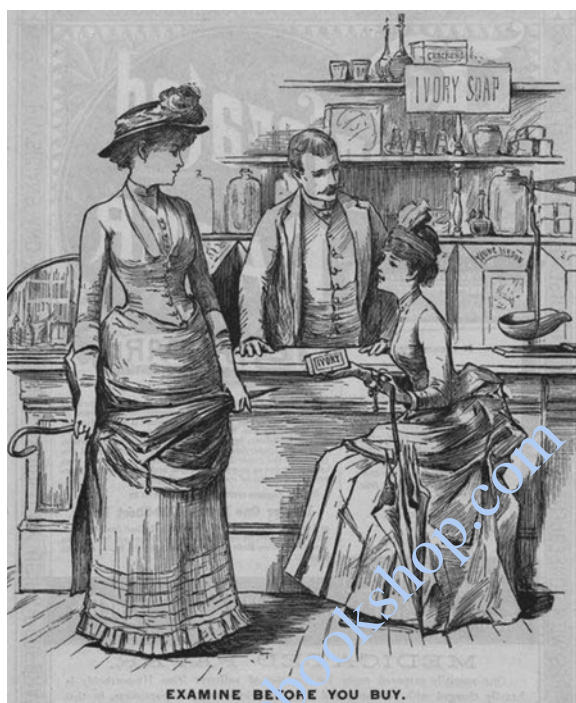
Figure 1.1 'Examine Before You Buy'. Century Magazine , printed in 1886.

This advertisement (Figure 1.1), 5 'Examine Before You Buy', ran in the Century Magazine in 1886 – it indirectly encouraged grocers to stock Ivory Soap so that their customers would not be fooled into buying soap of a lesser quality.