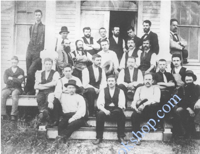
Figure 1.2 Edison, Seated at Center Holding a Hat, Developed a Highly Collaborative Culture at His Menlo Park Laboratory