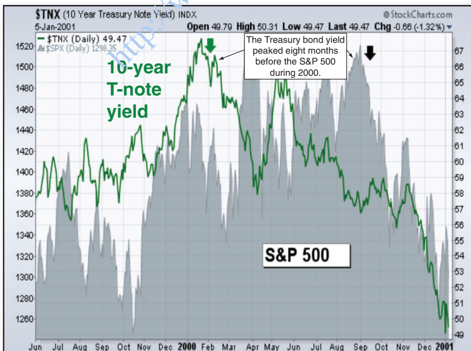
FIGURE 1.1 Drop in bond yield during 2000 warned of stock peak

If you're a bond trader, you should be watching trends in commodity markets. A jump in commodity prices, for example, is usually associated with a drop in bond values. In another illustration of how one market impacts on another, a falling U.S. dollar usually results in rising commodity prices. And, as you'll see later in the book, the direction of the U.S. currency helps determine the relative attractiveness of foreign stocks compared to those in the United States.