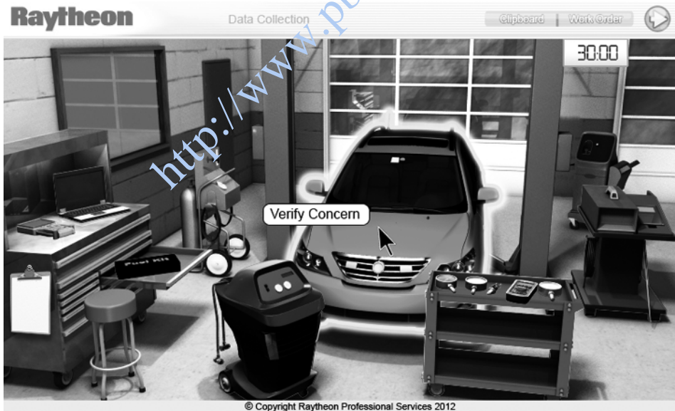
FIGURE 1.1. A Virtual Automotive Shop.

Figure 1.1 illustrates a virtual automotive repair bay. After reviewing a work order, the student technician can access the various on-screen shop tools to run virtual diagnostic tests. The results are saved on his virtual clipboard. As he works