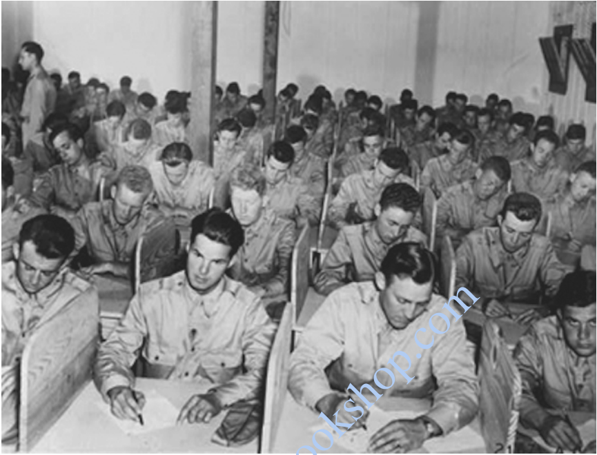
FIGURE 1.2 Image of U.S. Army Air Corps Cadets in 1942 Taking a Group Test to Help Determine Their Proficiency as Pilots, Navigators, or Bombardiers