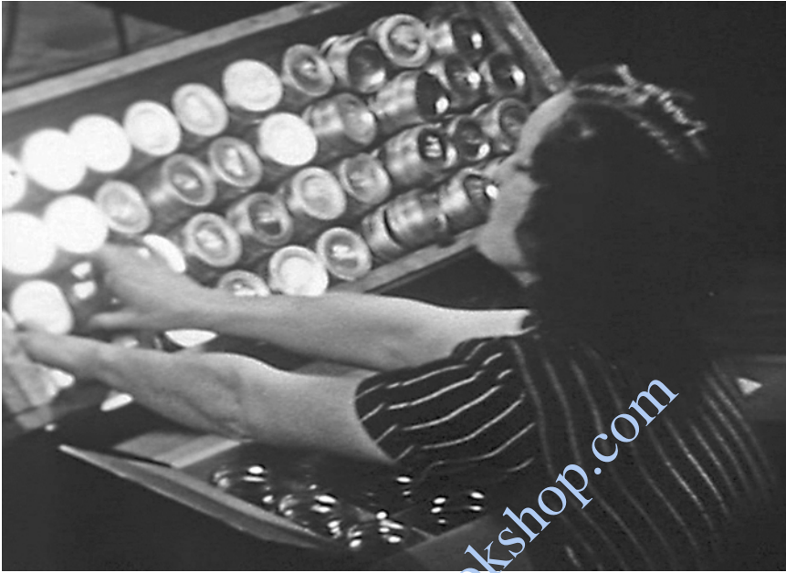
FIGURE 1.1 Image from Frank and Lillian Gilbreth's 1918 Ball Brothers Mason Jar Study That Targeted How to Improve Worker Efficiency by Reducing Motion

(DOT) and create a taxonomy of worker characteristics that could be used to select candidates. The program resulted in a taxonomy of forty-five characteristics used by states to hire and relocate staff, with the DOT itself published in 1939.