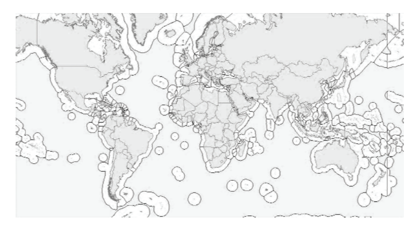
Figure 1.2. View of territorial waters and EEZ (white) forming waters under sovereignty and under jurisdiction, as opposed to zones outside jurisdiction (light gray) (source: www.vliz.be, adapted from Thema Map software, 2012, https://themamap.greyc.fr). Document does not presuppose any support for the claims of governments, from [GAL 12]

A rarer situation is the one allowed by the new international Law of the Sea in which a state, or several states jointly, may request to extend its (or their) legal continental shelf to the outer edge of the continental margin (a geomorphological concept); that is up to 350 NM (= 648,200 km) measured from the baseline, or by 100 additional NM (= 185,200 km) calculated from the 2,500 m isobath linking all points situated at 2,500 m of depth. The system applied is still the one of sovereignty over the legal continental shelf. In the event of agreement granted by the Commission on the Limits of the Continental Shelf (CLCS) to several States following their joint request, all that remains for these States is to mark out among themselves the lateral portions of the shelf belonging to each of them.