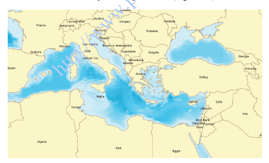
Figure 1.3. Semi-enclosed seas in the sense of article 122 of the UNCLOS. Document does not presuppose any support for the claims of governments