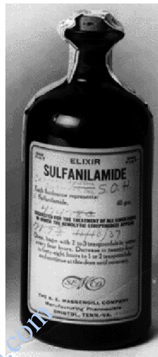
FIGURE 1.1 Elixir of sulfanilamide.

However, major revision of the food law stalled until a precipitous event fell while a significant segment of the public was paying attention. Sulfanilamide, one of the new sulfa drugs, was being used effectively to treat strep throat and other bacterial diseases (Figure 1.1). To increase the palatability of the bad tasting drug, a drug company mixed the antibiotic with diethylene glycol, a sweet tasting