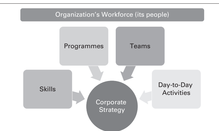
Figure 1.2 Improve company performance by aligning the workforce to the corporate strategy

To help illustrate this point, let us go back to our fictional company, Widgets-Are-Us, and explore an example of what this might look like for a typical company. We know that Widgets-Are-Us is a company that manufactures widgets. We also know that, to remain competitive and innovative in its industry, the company must continue to bring newer and better products to market faster than its competitors. Doing this requires the company to invest heavily in R&D and the newest technologies. From our earlier example, we learned that the company has decided to invest heavily in 3D print technology, so much so that the organization has shifted a large part of its strategy to developing more customized products created through 3D print technology. Because the company's longer-term strategy will change, it is important to note that the change will also have an impact on the company's longer-term workforce strategy. Let us examine how this new strategy might affect certain processes in the HR function. For starters, the recruiting team will need to understand the profile of candidates they will be required to source from a background and experience perspective, while HR business partners will need to understand the necessary skill sets for optimal performance of the new strategy. They will also need to understand how this new product approach will affect the traditional manufacturing processes in place. There also will be additional questions that arise, for example: